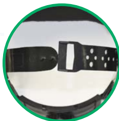
Adjustable pinlock headgear